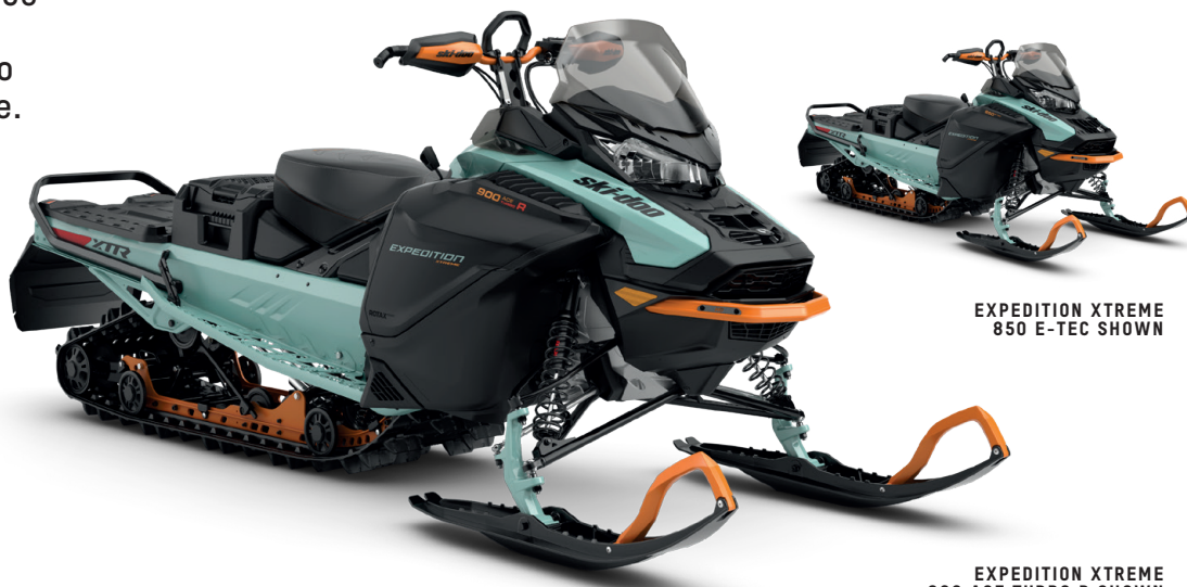
EXPEDITION XTREME 850 E-TEC SHOWN

The high-performance sport-utility sled with capability to go just about anywhere.